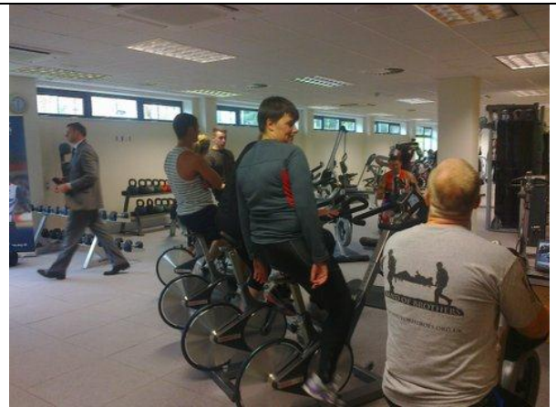
Inside the Rehabilitation Centre Gymnasium