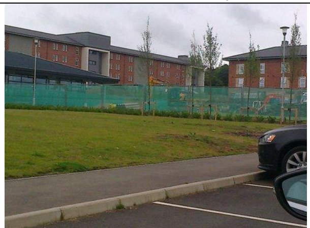
Outside shot of the facility